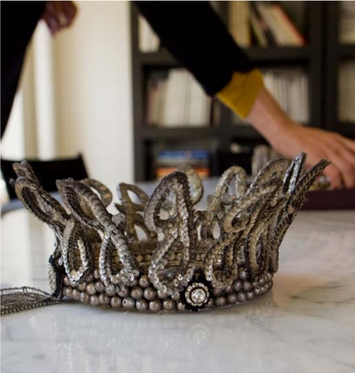
Crown of Js -- "I got this 'Crown of Js' last year from the team for my birthday."